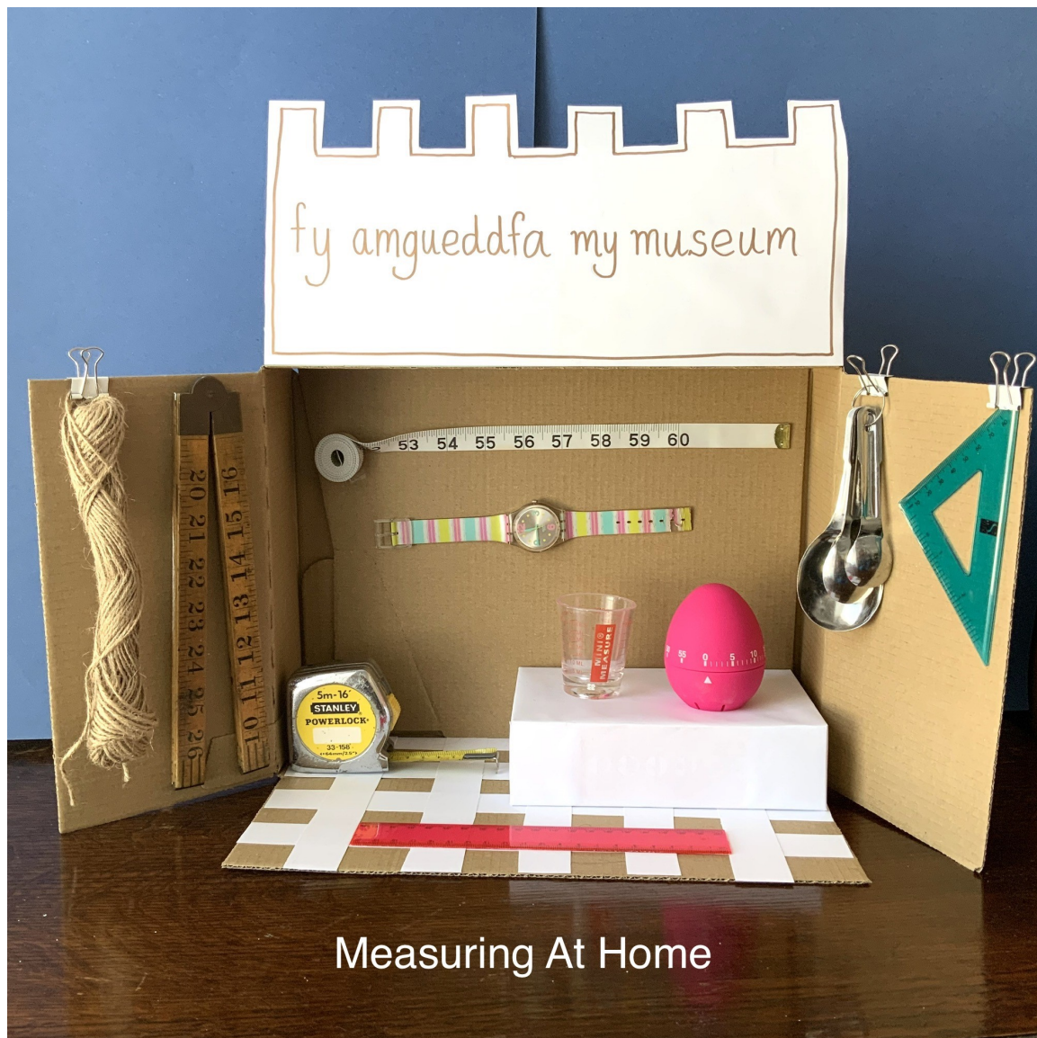
Measuring At Home

Here is an exhibition about Measuring at Home . I collected all the things I could find that fitted my theme. I could have included other things as well, such as toy bricks for example.